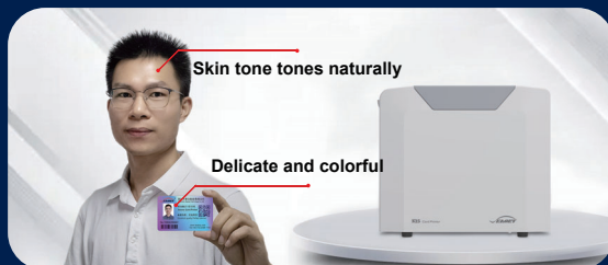
High quality photo processing by Dye sublimation technology

Dual interface card encoding module Contactless ID Card encoding module UHF chip card encoding module Magnetic stripe card encoding module