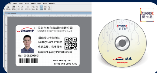
Come with professional printing software